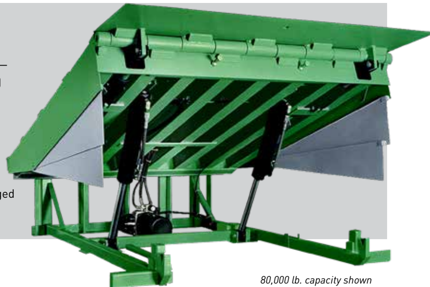
80,000 lb. capacity shown

The HHC Series Heavy-Capacity Hydraulic Dock Leveler — available in 60,000 lb. (27,215 kg) or 80,000 lb. (36,287 kg) capacities— is built to last in the most demanding environments. It's ideal for applications moving a large volume of heavy loads, such as in the paper production, auto manufacturing and steel industries. This hydraulic dock leveler integrates all the standard features that Kelley hydraulic levelers are known for, along with a rugged design for handling the toughest loads.